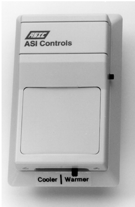
WS-RSO Wall Sensor